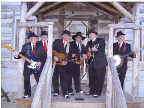
Dark Hollow Bluegrass Band Saturday, July 12, 2014 7:00 p.m. to 8:30 p.m.

FOR MORE INFORMATION PLEASE CALL (301) 739.8577 EXT. 183